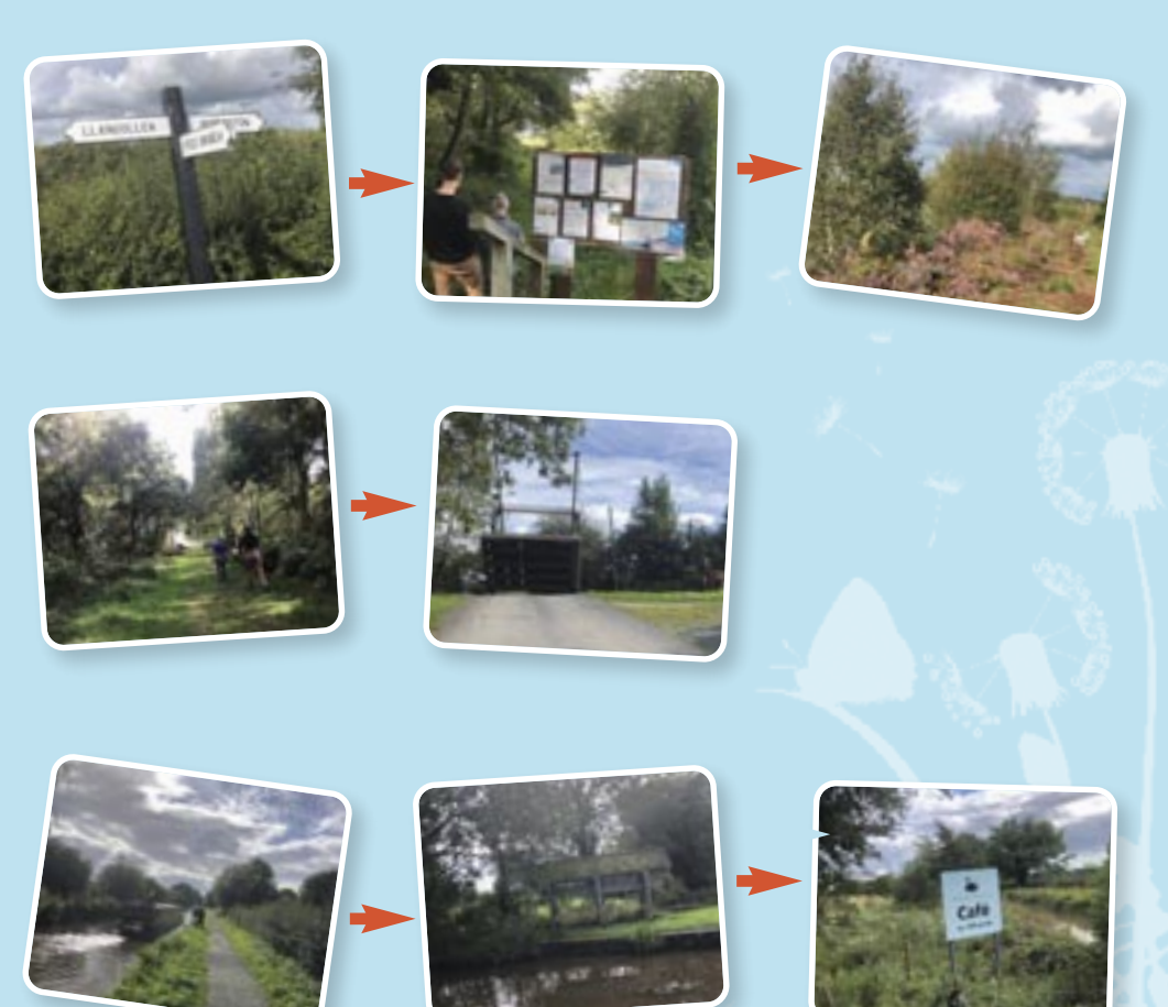
The walks in this leaflet have been compiled by local people. Please note: while we have tried to ensure that the information included in each of the walks is as accurate as possible, it is intended as a guide only and you may wish to refer to the local OS map for specific details of paths and local features.

You will walk past the site of Furber's Scrap Yard on the right and more great views of the Moss until you arrive back at Roving Bridge (No. 46) and you go across the bridge to get back onto the Prees Branch of the canal to complete the last stretch of this circular walk. Arriving back at Dobson's Bridge (No. 3), take the walkway back to the marina.